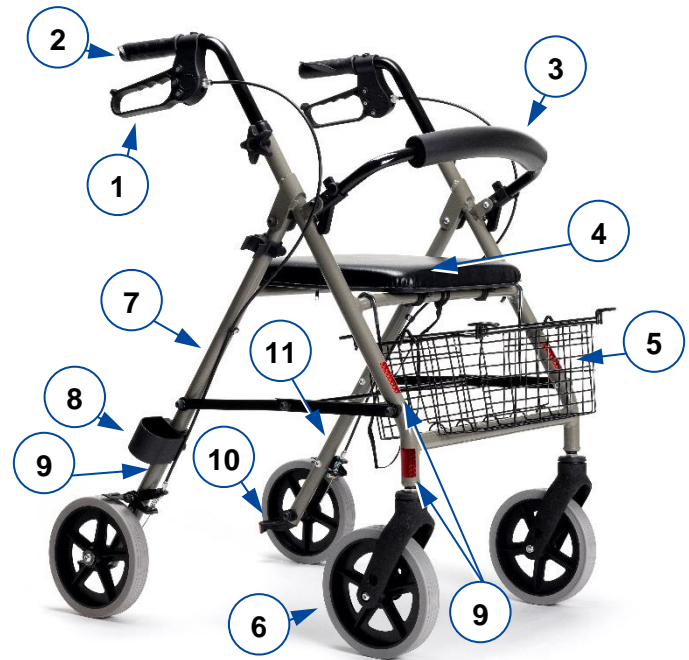
Figure 1 Eco-Light II