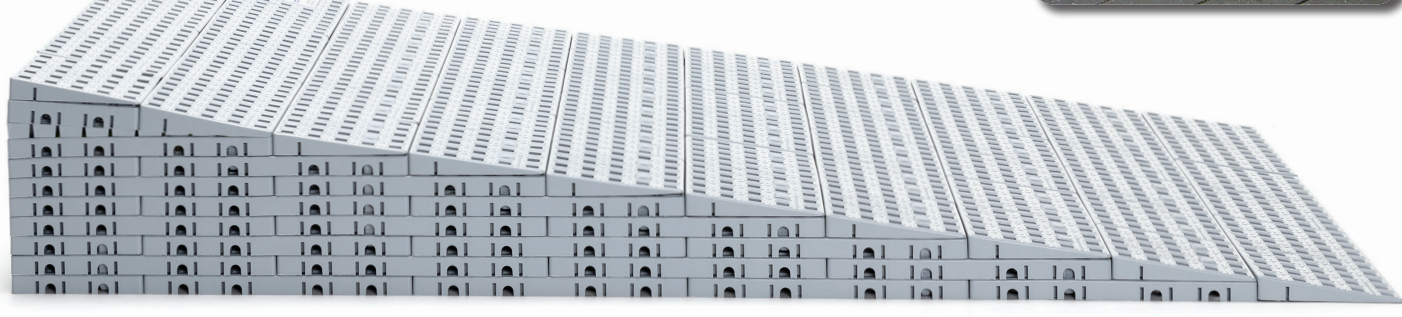
690 - KIT 5