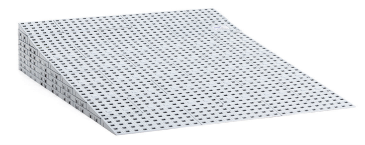
690 - KIT 4