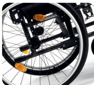
Rear wheels with quick-release system

All types of wheelchairs can be adapted, have numerous options and can be fully personalized so that there is a wheelchair for every person. This is the result of our continuous research and experience since 1957.