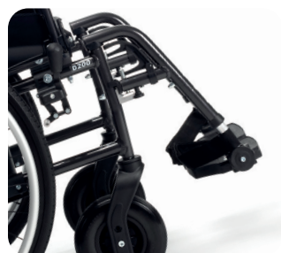
Removable swing-away leg rests (in and outwards)