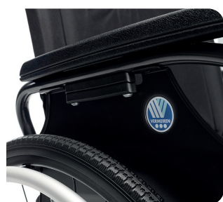
Armrests adjustable in height and depth to suit specific needs