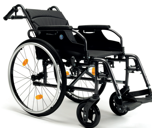
Option BZ8 - articulated legrest self-correcting in length