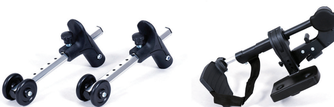
Option B78 - Anti-tipping wheels