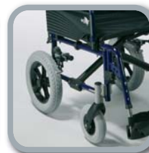
Optional (T30) push version