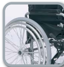
Optional (HEM2) hemiplegic kit